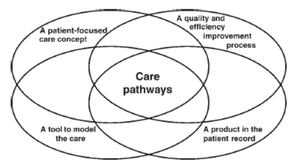
Figure 1 Care pathways as a concept, model, process and product

The aim of a clinical pathway is to improve the quality of care, reduce risks, increase patient satisfaction and increase the efficiency in the use of resources.